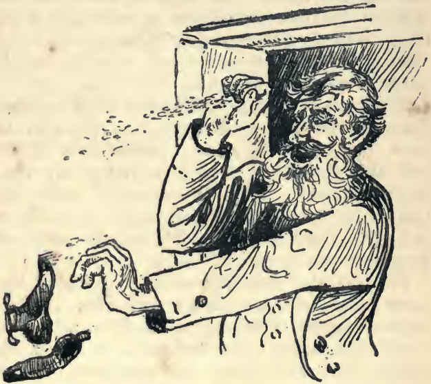
EVEN FOUND RICE AND THREW IT

her antagonist I was summoned from strapping my portmanteau to face the appalling duty of escorting the combatants, in Lady Knox's brougham, to the church outside the back gate, to which Miss Sally had preceded them in the donkey-carriage. I